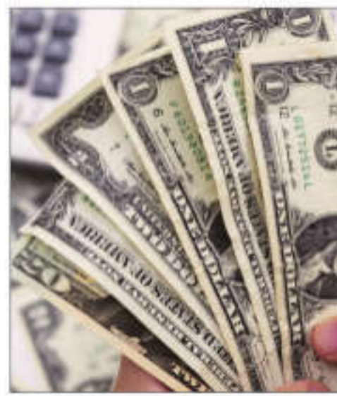
Top sectors in which FPIs were net sellers in October

FPI EQUITY ASSETS under custody (AUC) declined by 8.8% month-on-month to ₹71.1 lakh crore in October, marking the first decrease in a year. This decline in AUC was the sharpest since March 2020. In dollar terms, FPI AUC fell by 9.2%, from $930.5 billion in September to $845.3 billion in October. During October, FPIs sold a record Rs 94,017 crore ($11 billion) in the Indian equities market. They were major sellers in sectors such as financial services, oil and gas, FMCG, automobile, and consumer services. Benchmark indices declined by up to 6.2% in October.